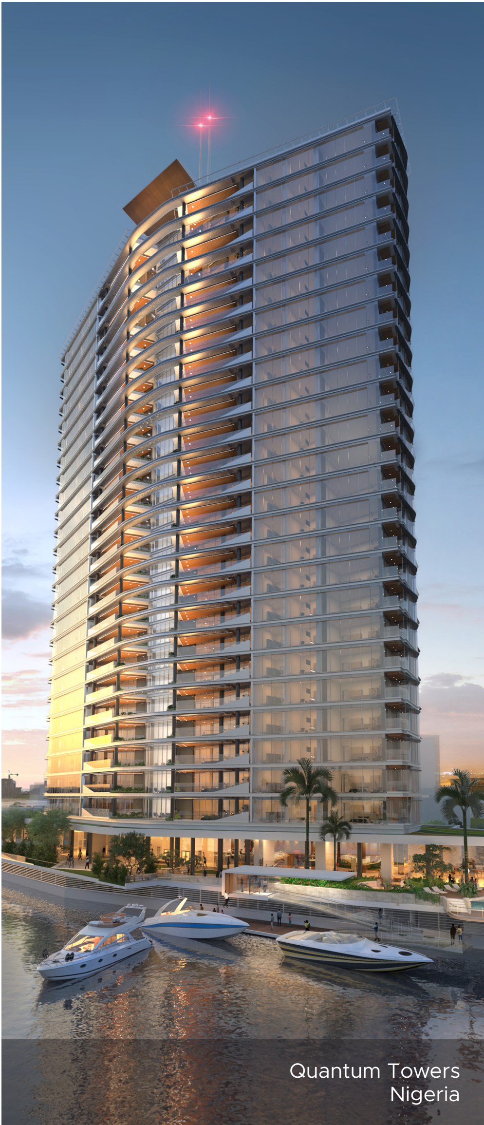
Quantum Towers Nigeria