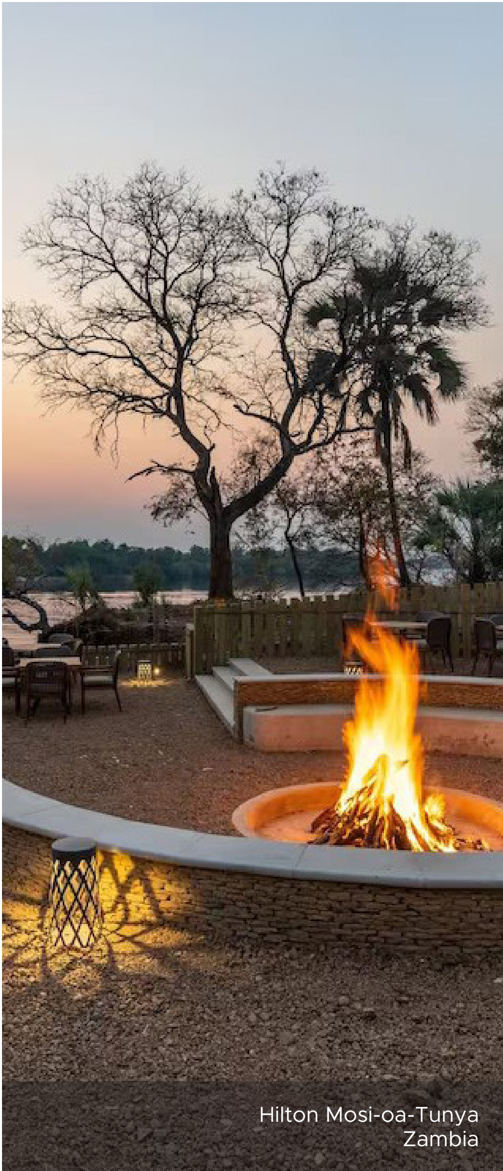
Hilton Mosi-oa-Tunya Zambia