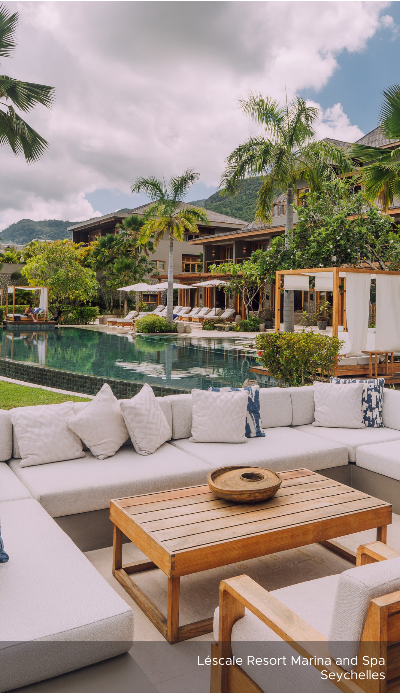
Léscale Resort Marina and Spa Seychelles

Are you a SACLAP registered Landscape Architect who is both design and technically minded with a love for management/organization?