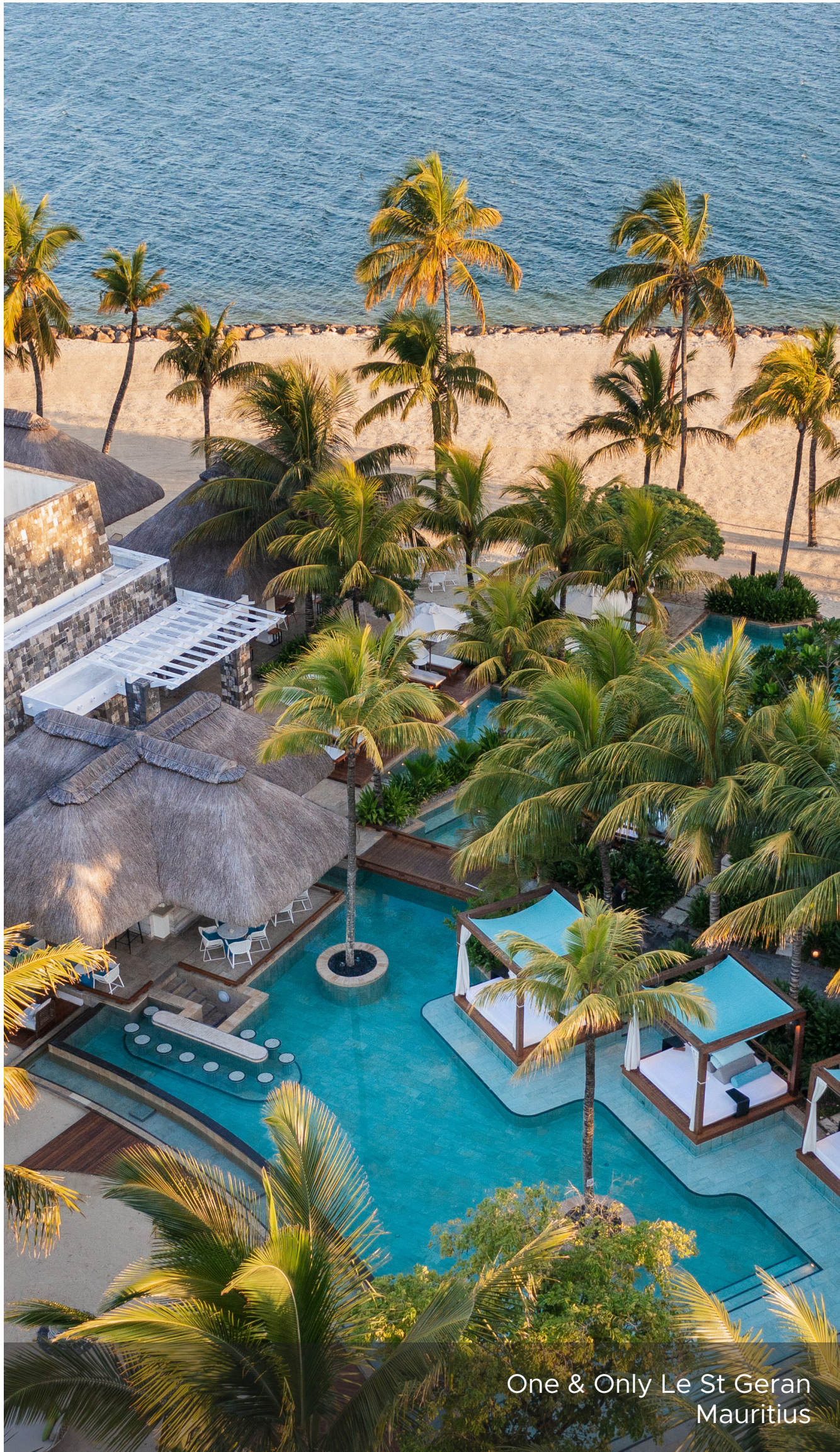
One & Only Le St Geran Mauritius