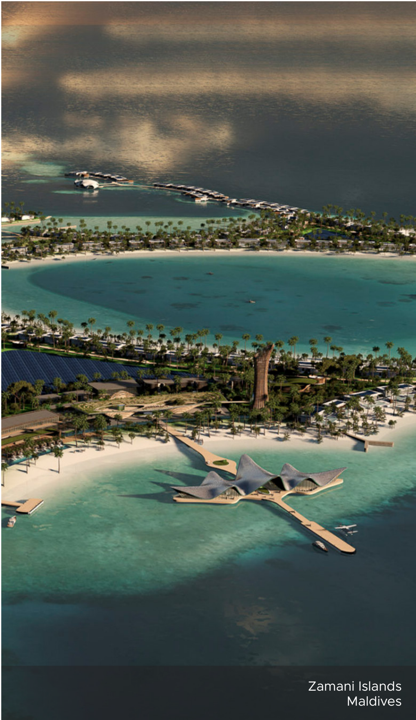
Zamani Islands Maldives