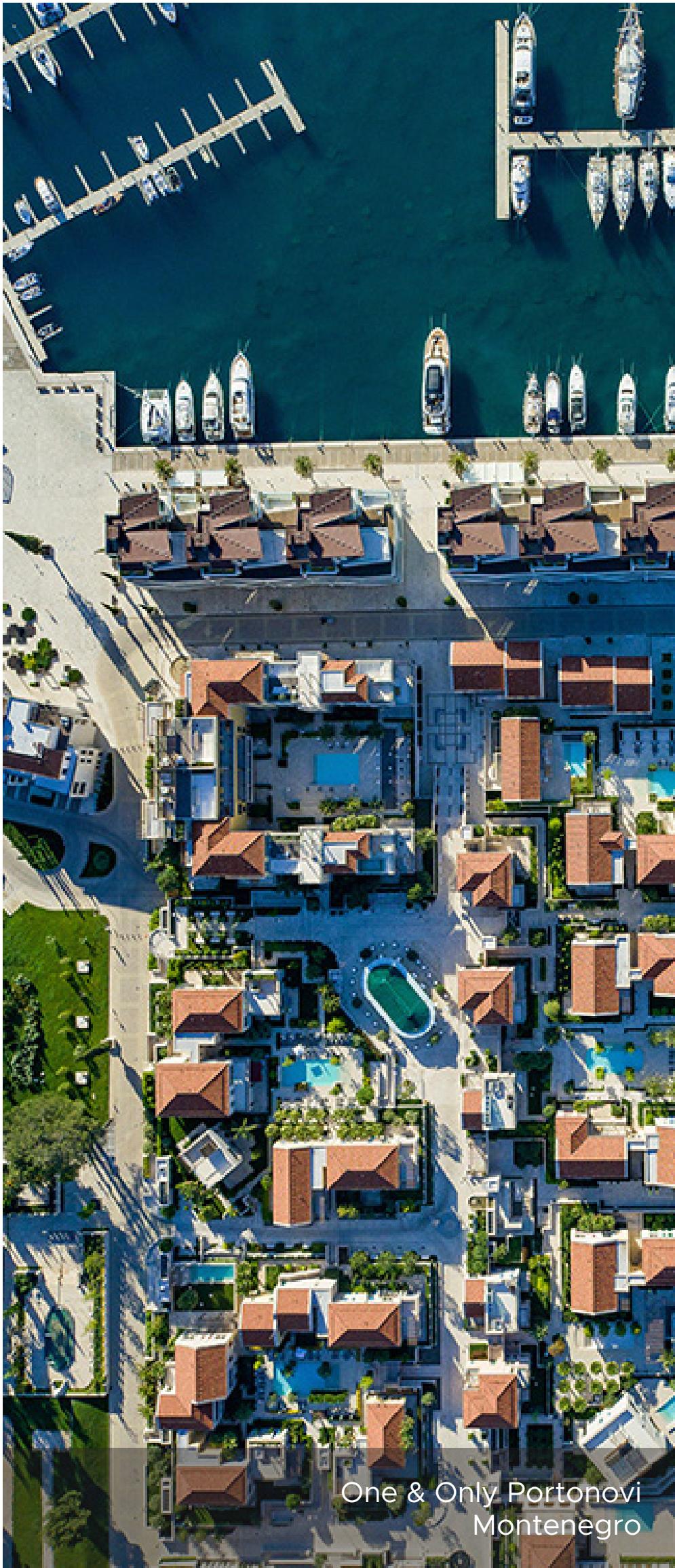
One & Only Portonovi Montenegro